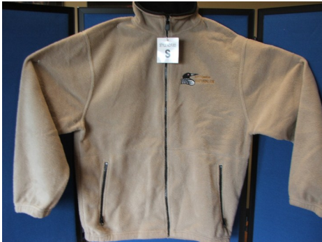
Fleece Jacket 13.5 oz, non-pill polyester fleece Khaki with black S-M-L-XL-2XL $20.00