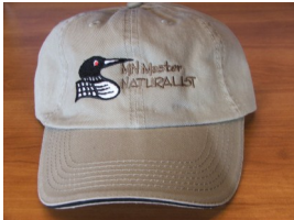
Baseball Cap One size fits most. Khaki $12.00

All clothing has the Minnesota Master Naturalist logo on it. Additional sizes may be ordered upon request, if available. An additional charge may be assessed for special orders.